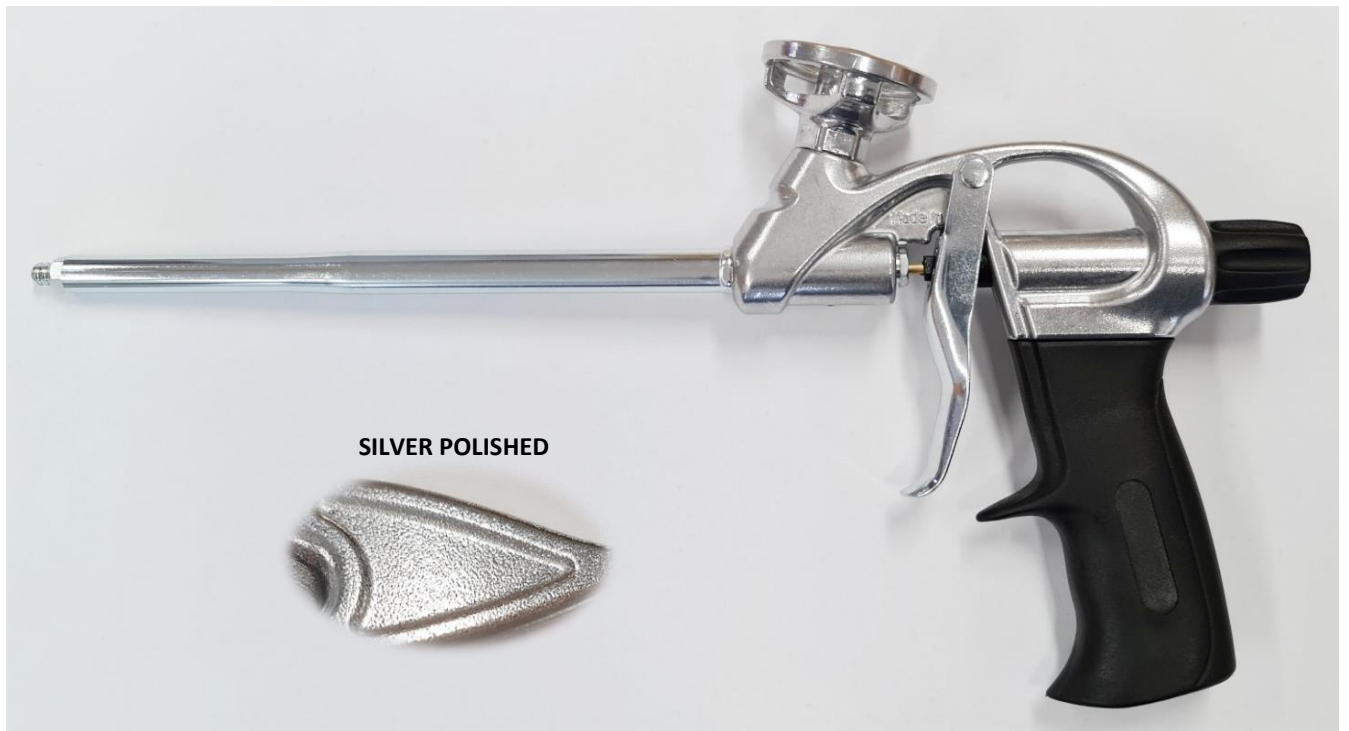
Type: MVA-1 TA + Non-stick coated adapter